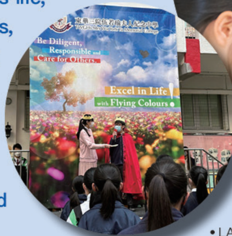
• LAC Drama

Our school is dedicated to creating a lively English learning environment, immersing students in an English atmosphere every day. English has become an integral part of campus life, from morning assemblies to lunchtime broadcasts, ensuring that students are constantly immersed in the language. Beyond in-school English activities, we encourage students to actively participate in city-wide English events and competitions. This increases their opportunities to engage with the language, boosting their learning confidence and overall English proficiency.