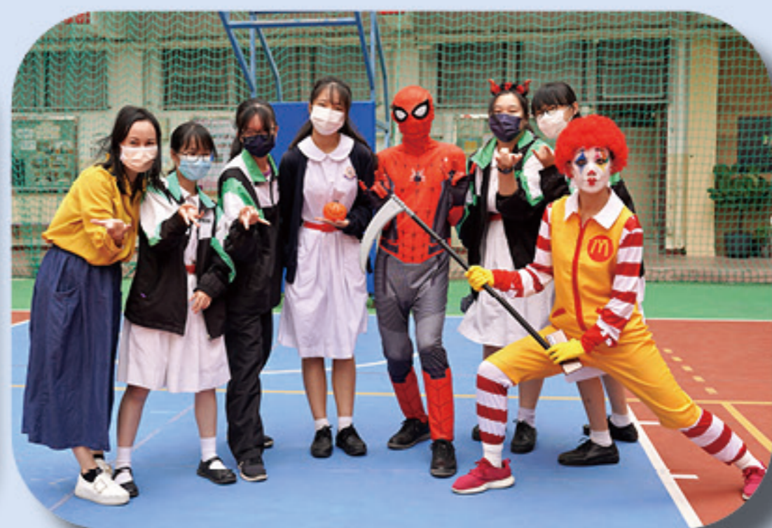
• Halloween Fun Day