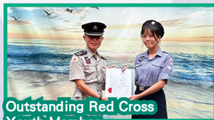
Outstanding Red Cross Youth Member