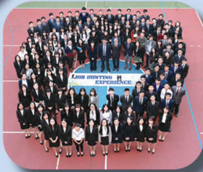
• Job Hunting Experience

in learning English. Additionally, students actively participate in various external English activities, such as RTHK's Teen Time English program, visiting the Google Office, and inter-school English speaking training, which enable them to speak English confidently.