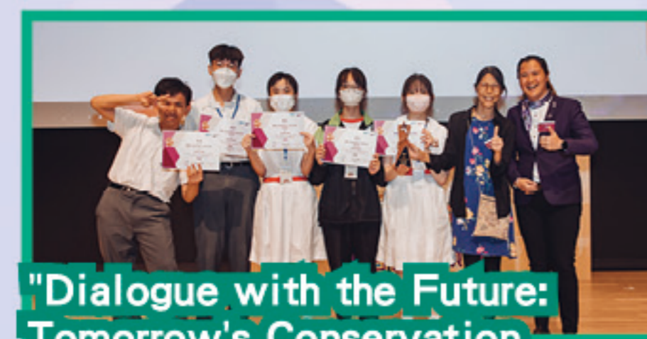
"Dialogue with the Future: Tomorrow's Conservation Leaders" Event