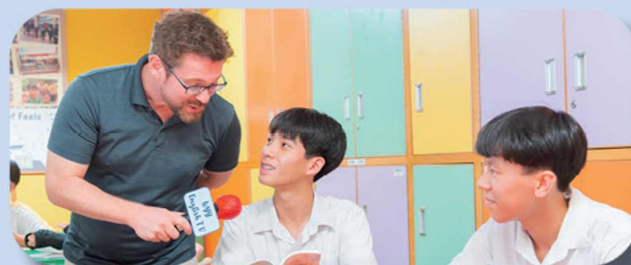
• English Campus TV Interview