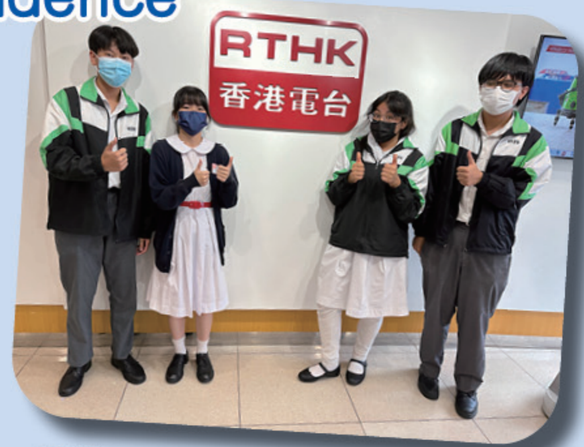
• RTHK Teen Time Live Recording

Our English Department frequently collaborates with different groups within the school to facilitate practical language application. For example, we co-organize the "Form 5 Job Hunting Experience" with the Careers and Guidance team annually, where students write job application letters and participate in mock English job interviews in formal attire. Our native English-speaking teachers also host various lunchtime activities at the English Corner to spark students' interest