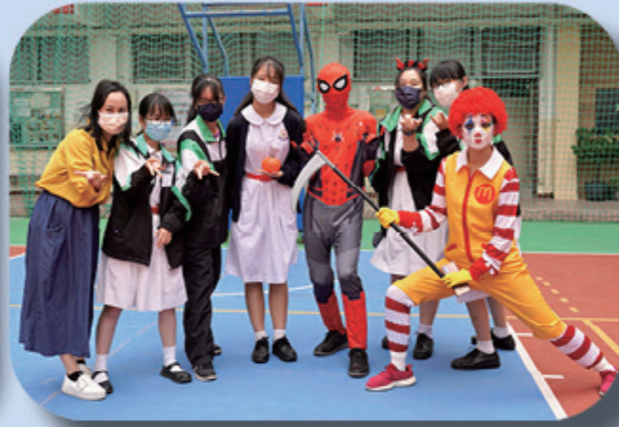
• Halloween Fun Day