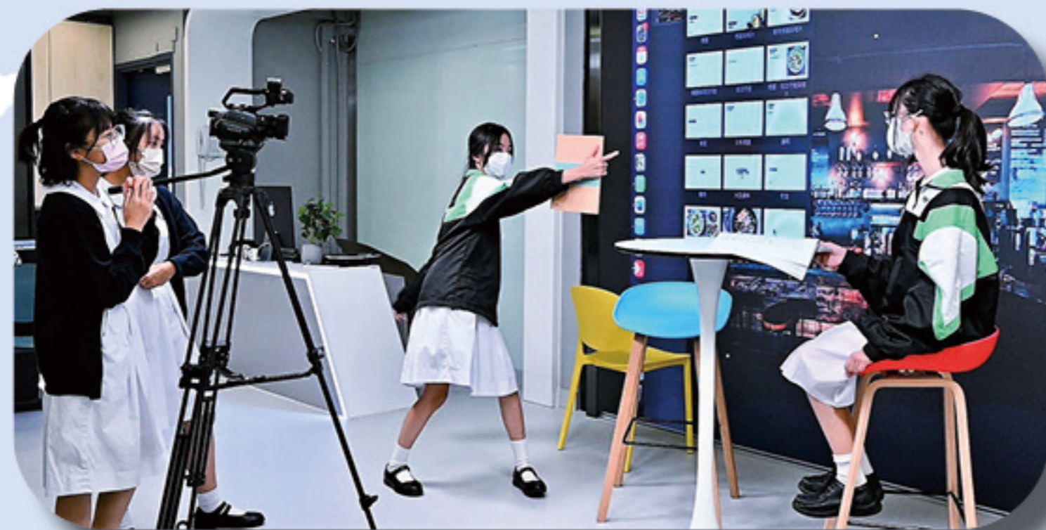
• Senior Form LAC Project