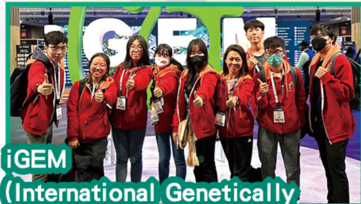
iGEM (International Genetically Engineered Machine Competition)