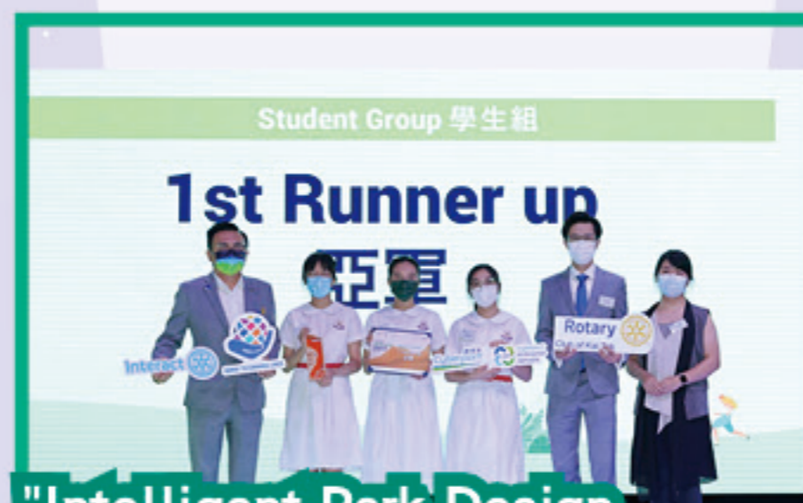
"Intelligent Park Design Competition"