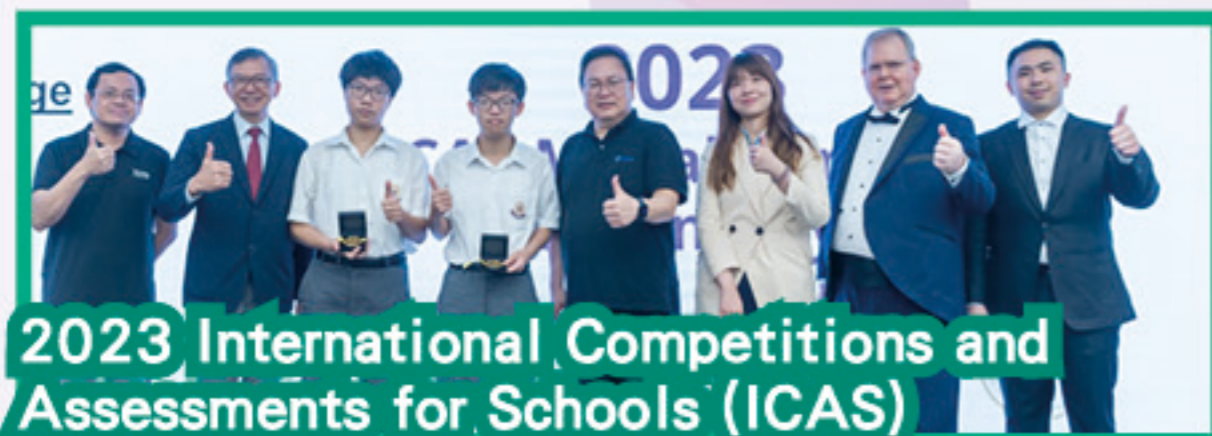
2023 International Competitions and Assessments for Schools (ICAS)