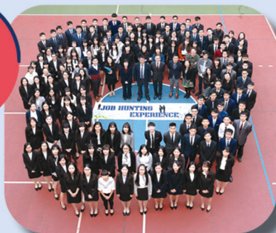
• Job Hunting Experience