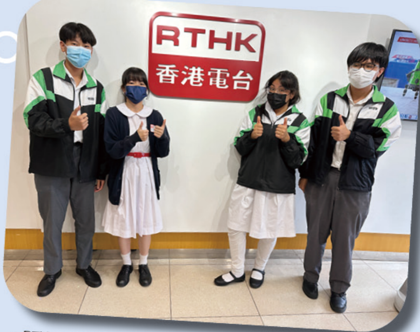
• RTHK Teen Time Live Recording

為加強同學英語會話能力，英文科經常與校內不同組別合辦活動，例如每年與升學及就業輔導組合辦「中五求職體驗」(Job Hunting Experience)，讓學生撰寫求職信和穿著整齊套裝參加模擬英語工作面試。外籍英語教師亦會在英語角舉行不同的午間活動，藉此引發同學學習英語的興趣。在校外，同學亦積極參與不同類型的英語活動，包括香港電台的Teen Time英語節目、參觀Google Office、聯校英語說話訓練等，這些活動能讓他們自信地運用英語。