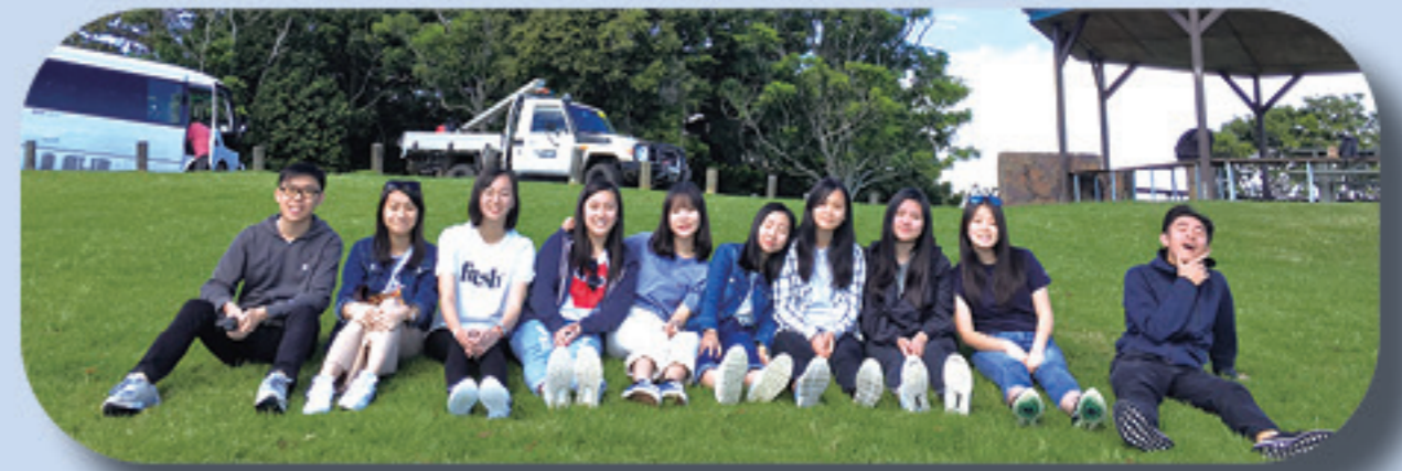
• Study Tour to Australia

Cultural experience is a vital part of learning English. Therefore, our English Department has established four different cultural categories: "Festive Fiesta," "Life & Values," "Sports Sensation," and "Literature Lovers." These categories allow students to experience cultures both inside and outside the school, integrating English and positive values into their lives. Moreover, our students actively participate in cultural exchange programs, traveling to places like San Francisco in the USA, Australia, and the Philippines.