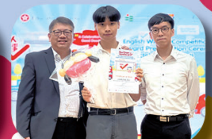
• Good People Good Deeds