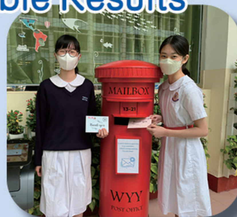
• WYY Gratitude Day

Our school implements "Language across the Curriculum" (LAC) in a school-wide participation model. We conduct interdisciplinary English activities at both junior and senior levels, including LAC drama performances, LAC writing, designing English e-magazines, and LAC project research. These activities highlight the importance of English in interdisciplinary applications and enable effective use of English across various subjects. Our school has been awarded the "Chief Executive's Award for Teaching Excellence" by the Education Bureau, acknowledging our achievements in English teaching.