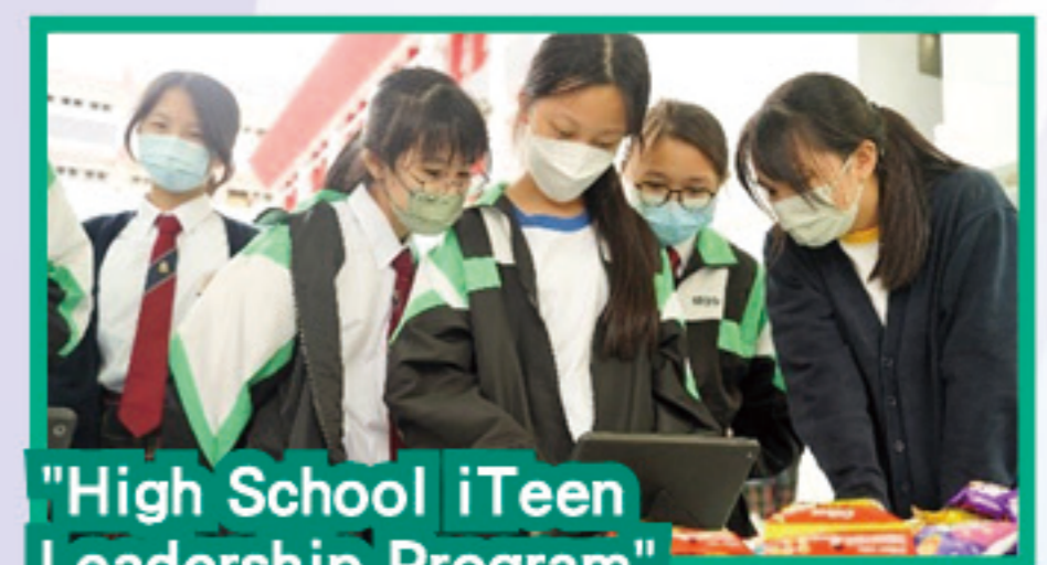
"High School iTeen Leadership Program"