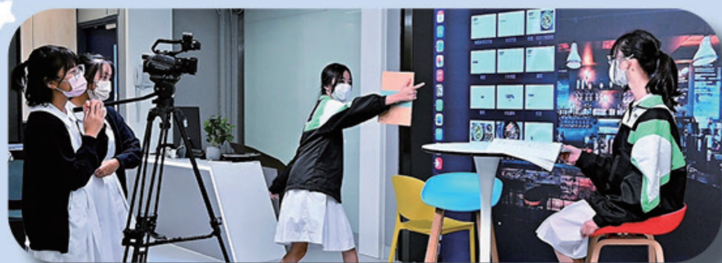
• Senior Form LAC Project