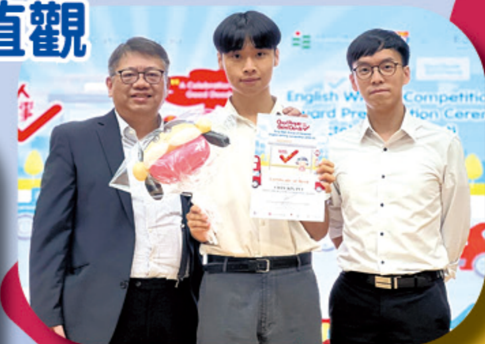
• Good People Good Deeds English Story Writing Competition