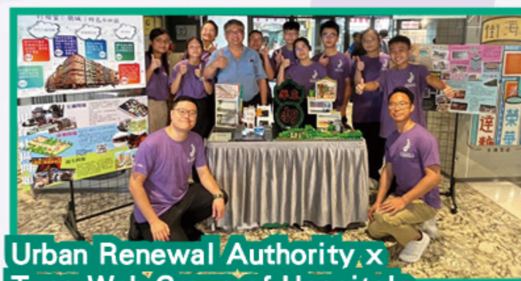
Urban Renewal Authority x Tung Wah Group of Hospitals Youth Leadership Program