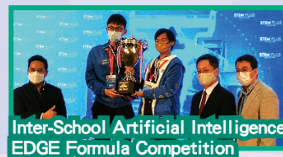
Inter-School Artificial Intelligence EDGE Formula Competition