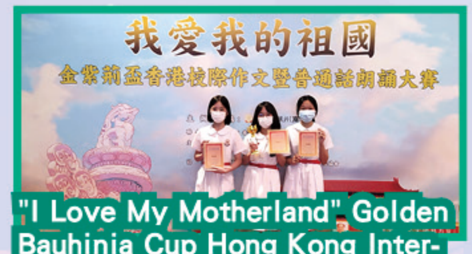
"I Love My Motherland" Golden Bauhinia Cup Hong Kong Inter-School Essay and Mandarin Speech Competition