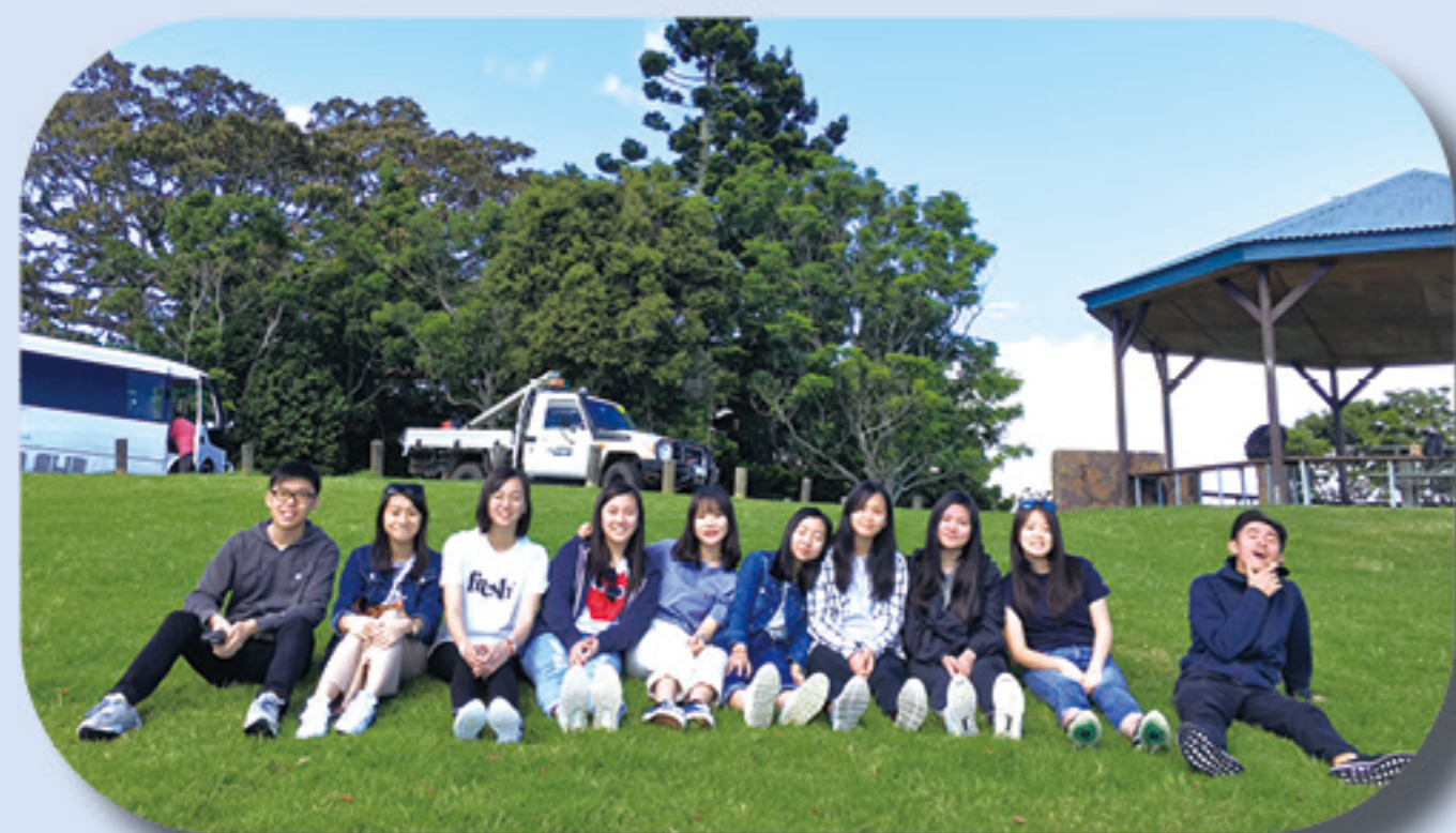
• Study Tour to Australia