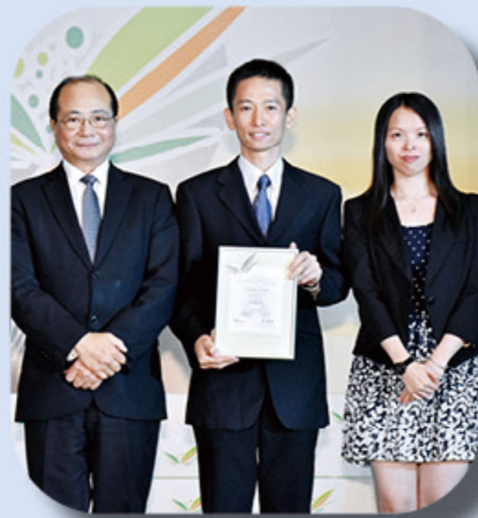
• Chief Executive's Award for Teaching Excellence

本校以「全校參與模式」推行跨科英語學習(Language across the Curriculum)，在初中及高中進行跨學科英語活動，例如跨學科話劇表演、跨學科寫作訓練、設計英語電子雜誌、跨學科專題研習等，讓學生明白英語在跨學科應用中的重要性，並能有效地在各個科目中活用英語。本校曾獲教育局頒發「行政長官卓越教學獎」，以表揚本校在英語教學方面的成就。