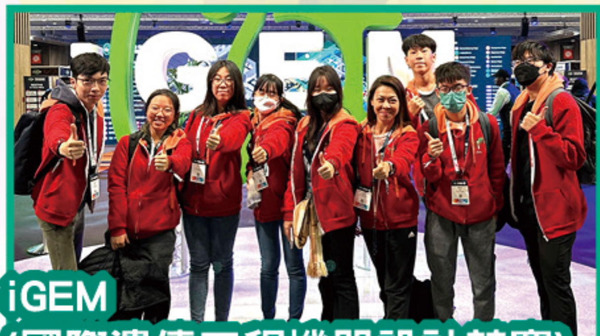
iGEM (國際遺傳工程機器設計競賽)