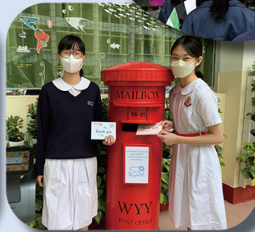
• WYY Gratitude Day