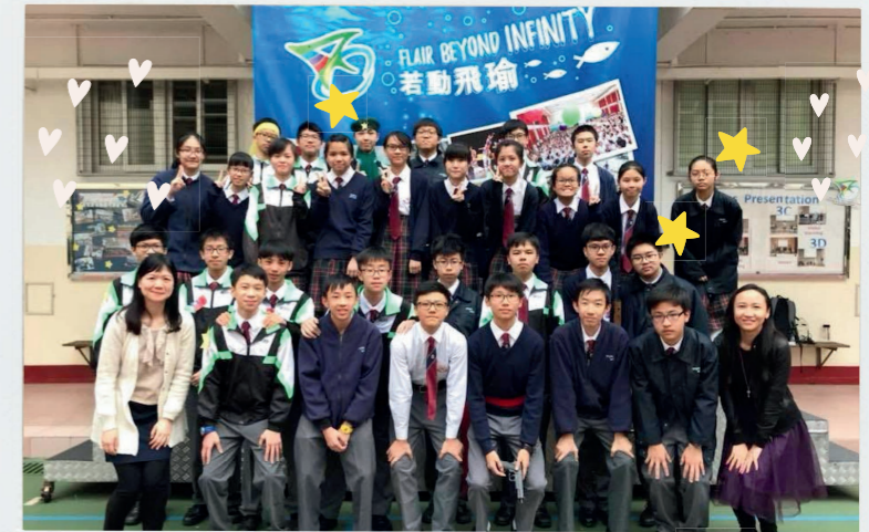
Class of 2021