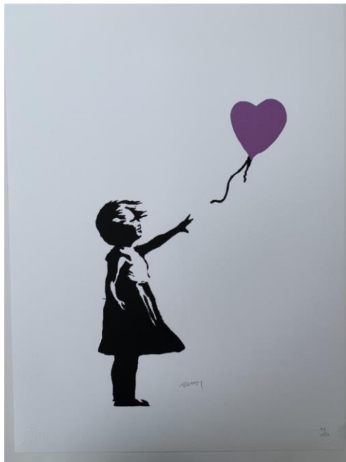
Girl with Balloon, Banksy