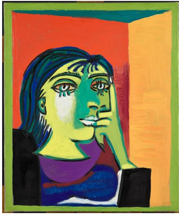
Pablo Picasso. Portrait of Dora Maar , 1937. Oil on canvas. Musée national Picasso-Paris. © Succession Picasso 2025.