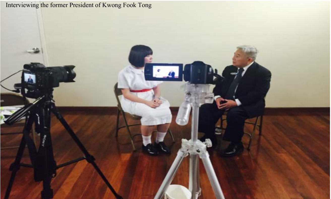
Interviewing the former President of Kwong Fook Tong

In order to celebrate the establishment of Tung Wah Group of Hospitals 145 years ago, Tung Wah is collaborating with the Chinese American Museum to launch an exhibition called 'Tales of the Distant Past: The Story of Hong Kong and the Chinese Diaspora'. 18 students were sent by Tung Wah to Los Angeles to explore the philanthropic spirit and core values of Tung Wah. The students will make videos about the Chinese diaspora and the development of Tung Wah, which will be presented in moral education lessons. Selected by principals, 54 students from 18 secondary schools of Tung Wah competed for 18 seats to go to LA (Los Angeles ) or Kaiping. Fortunately, after two rounds of interviews, I was successfully selected by the Chairperson and the Directors of Tung Wah.