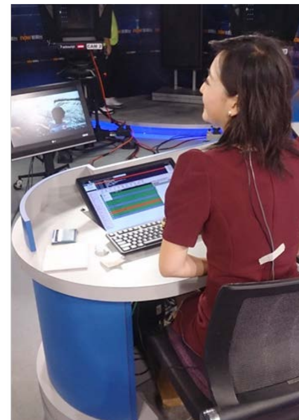
▲ The truth behind the desk.

An anchor doesn't wear shoes when she is reporting news! The reason is that anchors have to read the script by stepping on the pedal which is connected to the prompter under the desk. A prompter ensures that anchors can look straight into the camera while reading the script. Without the shoes, anchors can step on it more comfortably and easily! It is rarely known to anyone, isn't it?