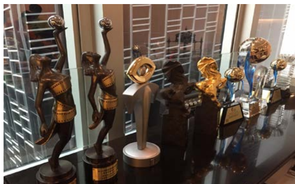
▲ It was exciting for us to see so many awards placed there!