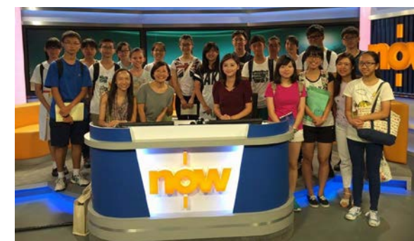
▲ Let's be the anchors!