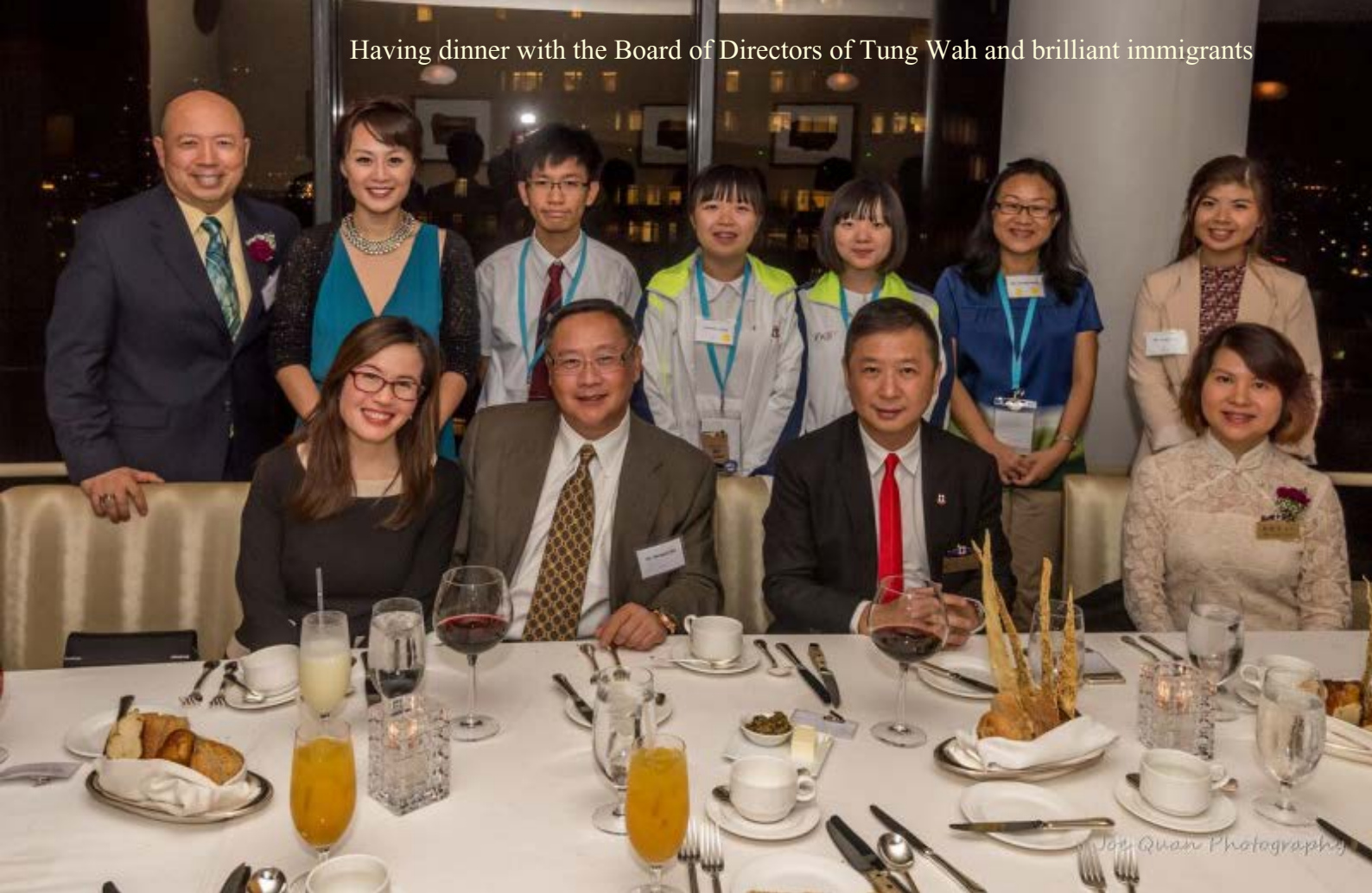
Having dinner with the Board of Directors of Tung Wah and brilliant immigrants