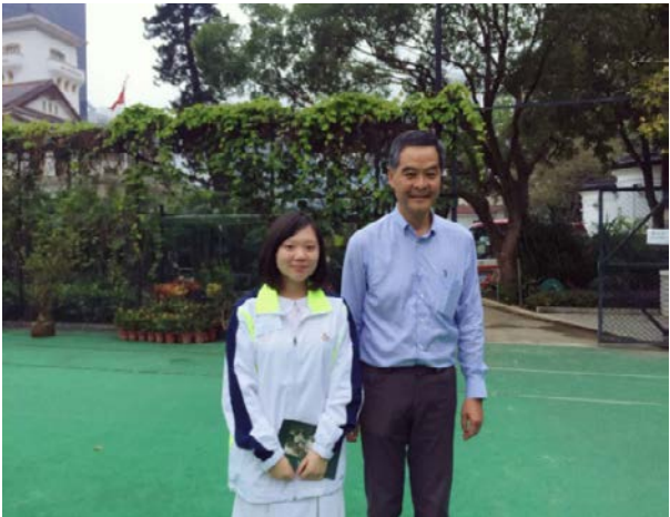
▲The Chief Executive CY Leung is very interested in our student tour.